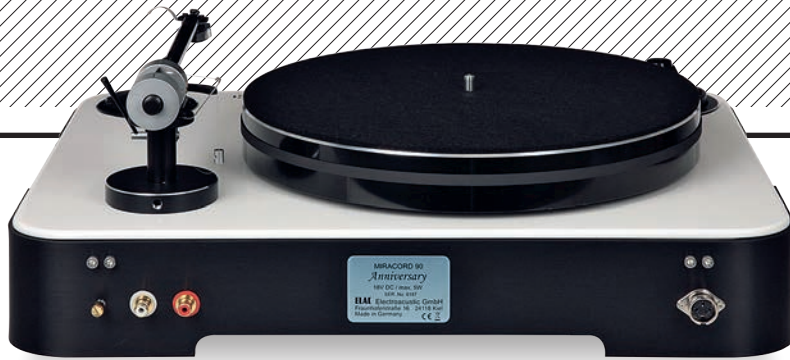
ABOVE: Supplied as a ready-assembled package, the carbon-tubed arm is wired into gold-plated RCA outputs on the rear of the deck. Both downforce and bias are set the 'old-fashioned' way with thread-and-weight and counterweight, respectively

Ray Manzarek's keyboard, this might not seem like much of a departure. But the organ was perfect for showing the clarity and crystalline capabilities of the Miracord 90 on this track and 'Light My Fire'.